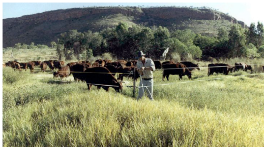
Photo 2: By 2001, under determined, active management each hectare, each year now yields sufficient feed to satisfy 800 cows for a day

The savannah lands of Australia and the rest of the world are currently often either inappropriately managed, not managed at all, or have already experienced severe breakdown of natural function, and as a consequence they are presently degrading (such as in Photo 1 to the left). Observation of this degradation has led to the widespread but (we submit) erroneous belief that the savannah environments are over utilized. It is our submission that between now and 2050, under active and appropriate management these same savannahs have the capacity to consume massive amounts of GHGs from atmospheric circulation, and may in fact have sufficient capacity to make a global target below 550ppm or even 445ppm practical and achievable.