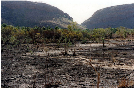
Photo 1: In 1992 each hectare of this area, located near Kunnanurra, WA could supply one day of feed per year for one cow